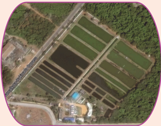
VIEW OF THE ICAR-CIFE, KAKINADA CENTRE FWFF